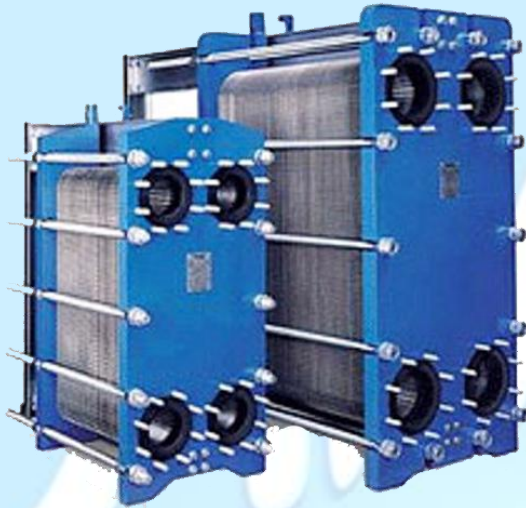
Plate Heat Exchanger